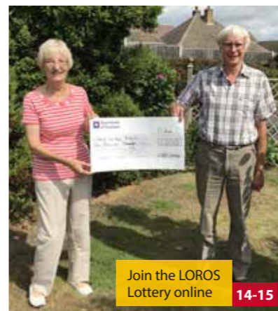
Join the LOROS Lottery online 14-15