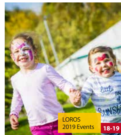
LOROS 2019 Events 18-19