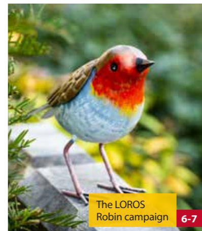
The LOROS Robin campaign 6-7